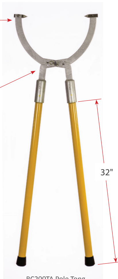
RC200TA Pole Tong