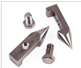
RC200RK Teeth Replacement Kit