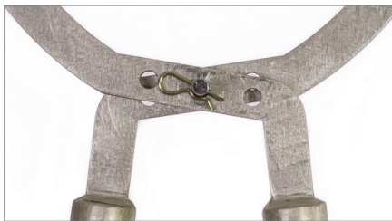
Adjustable Hinge Positions for Secure Handling of a Wide Range of Pole Diameters