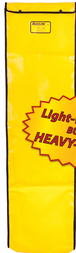
R60-076 Storage Bag