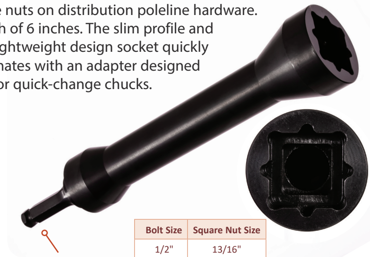
Hex Adapter for 7/16" Quick Change Chuck